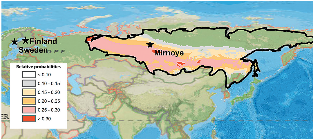
Fig. 2. Combined probability map of origin for 20 Fennoscandian Yellow-browed Warblers against a prediction map based on \delta^2\text{H} value in tail feathers from 22 nestlings in Central Siberia. Grid cell probabilities (originally with very low probability each) are linearly scaled for convenient comparisons. Delineation of the known breeding range (black borders) according to IUCN (2017). Stars represent the three sampling locations in Sweden, Finland and Mirnoye, Russia (west to east). Base map: National Geographic World Map by permission to the Swedish University of Agricultural Sciences.

in Fennoscandia in autumn were born in a region with higher \delta^2\text{H}_p values than, i.e., W and/or S of Mirnoye in Central Siberia. The observation that Mirnoye breeders had intermediate \delta^2\text{H}_f values could be an effect of immigration due to low breeding site tenacity (Bourski 1994, Bourski & Forstmeier 2000), but also of deuterium-depletion processes resulting in lower \delta^2\text{H}_f values in nestlings relative to their parents (Meehan et al. 2003, Smith & Dufty Jr. 2005, Betini et al. 2009, Marquiss et al. 2012). Both factors make \delta^2\text{H}_f values from breeding adults inadequate for comparisons with autumn vagrant YBW. We suggest feathers from nestlings to be the hallmark of choice for other species with a similar moulting strategy as well.